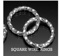
SQUARE WIRE RINGS

This workshop is perfect for the beginner, the beader, or the metal clay enthusiast who wants to make their own strong, reliable clasps to complete their projects. Nanz will expertly guide you as you learn how use Fretz hammers in making 3 styles of "S" clasps. Plus, other easy forging techniques will be taught to make twisted square wire toggle clasps, rings and earrings with a minimal amount of soldering and sawing. The class provides copper wire to practice with and silver wire to make the finished projects. For those who want to