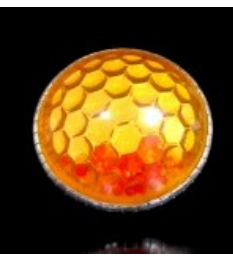
Vintage Glass Reflector

Having to turn down the opportunity to go this year myself, I anxiously awaited their return with the boxes and bags of new stones and product we look forward to every year. The fun of this buying trip is getting out of the world of catalogs, meeting the vendors, and being able to pick up and hold stones in your hands before purchasing them.