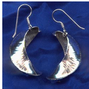
Fold Formed Earrings

artist and instructor here in the Northwest. We have narrowed down the possible classes to just four. 1) Tool Making - Chasing Tools and Pattern Stamps 2) Fold Forming 3) Anticlastic